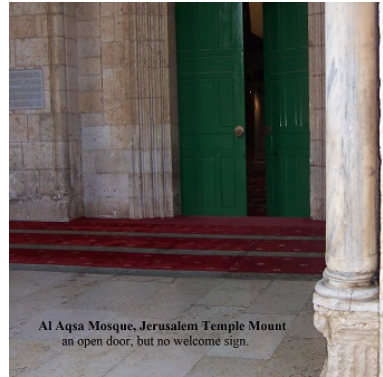
Al Aqsa Mosque, Jerusalem Temple Mount an open door, but no welcome sign.

First consider that in the single reference in the Qur'an where Allah's servant visited a “distant mosque”, the word mosque at the time meant any place of worship, not just an Islamic place of worship. Thus Qur'an 17:1 has an unspecified servant going to an unspecified temple. It might have been any existing temple, synagogue, church,