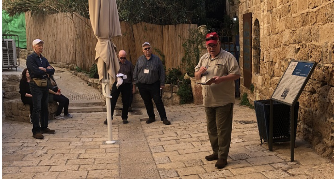
Commenting on a verse in Leviticus that describes the curses that will befall the land of Israel, Nachmanides wrote that the devastation "constitutes a good tiding, proclaiming that

Nevertheless, the sage, whose Torah commentary is still studied, had an altogether surprising interpretation of the desolation he encountered. He saw it as a blessing in disguise.