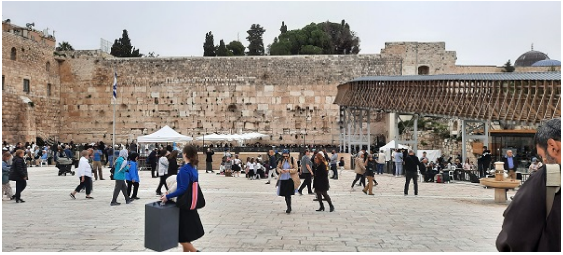
down into the Western Wall Prayer Plaza to, ... have prayer, I guess, to pray over the lad. I missed being at the prayer wall. It is true born- again Christians can come boldly unto the throne of grace and obtain mercy from any location or place we might be, (that's

Welcome to the Western Wall a remnant of the Temple "Request the welfare of Jerusalem; may those who love you enjoy tranquility. May there be peace in your wall, tranquility in your balances" Psalms 122:6-7)