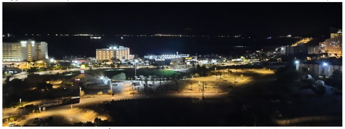
On deck, Day 12, March 27<sup>th</sup> at Timna Park and Solomon's Pillars, then hours at the Model Tabernacle, and a restful repose on the Red Sea at Eilat.

There was one more stop for the day, the bus turned south and we headed for a salty beach on the southern end of the Dead Sea, we were headed for the David Dead Sea Hotel<sup>11</sup> (31°12'09.23"N 35°21'41.03"E). The visit to, and float in, the Dead Sea was so extraordinary it requires another Half Shekel to cover it all. The hotel and the kosher supper were every bit as exotic as their advertisements. That would end our Lord's Day.