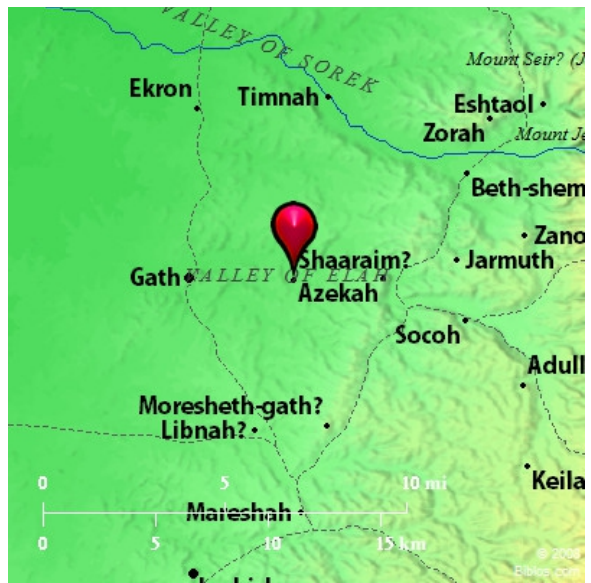
Valley of Elah & Valley of Aijalon maps by <a href="https://bibleatlas.org">https://bibleatlas.org</a> Created using Biblemapper 3.0

dar? Columbus built a castle here, called Via Ramal Dome, to blockade Jerusalem from the sea.