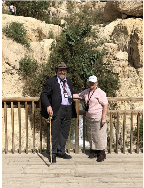
Image Location Index

We had only an hour here and we had to be off to an exciting visit to Masada.