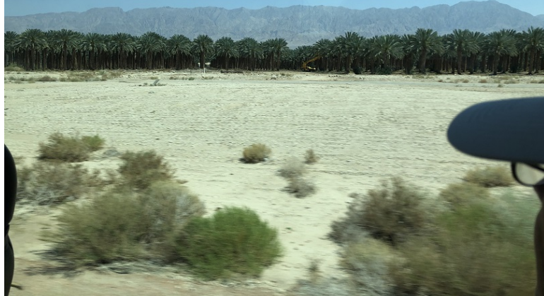
Eliat, Israel, Isrotel Yam Suf Hotel on the Red Sea 27 March 2023 15:40

The wilderness and the solitary place shall be glad for them; and the desert shall rejoice, and blossom as the rose. It shall blossom abundantly, and rejoice even with joy and singing: the glory of Lebanon shall be given unto it, the excellency of Carmel and Sharon, they shall see the glory of the LORD, and the excellency of our God (Isa.35:1-2).