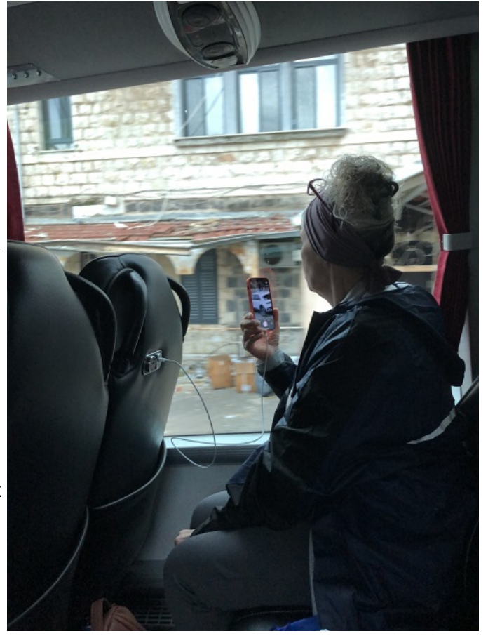
hs2307.odt - pg 1 of 10

We begin our day with breakfast and fellowship and then on the bus for another day of our tour. Today we are headed for the Northern end of Israel to visit five major sites that you see on your map.