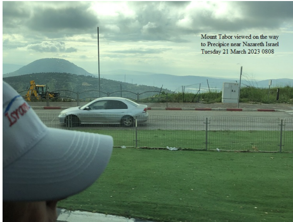
Mount Tabor viewed on the way to Precipice near Nazareth Israel Tuesday 21 March 2023 0808

packing was done last night, so after reading Joshua 8 and 9, and Psalms 81, on the 81st day of the year, we had our bags in the lobby of the Lake House Hotel, Sea of Galilee, at 0630. The trick of spending 14 days on an Israel tour with only one small check bag and one carry-on, without smelling funny on Day 14, had to do with washing laundry in hotel sinks and drying clothes on hotel shower curtain rods. On Day 6 we were as fresh and happy as we were on Day One.