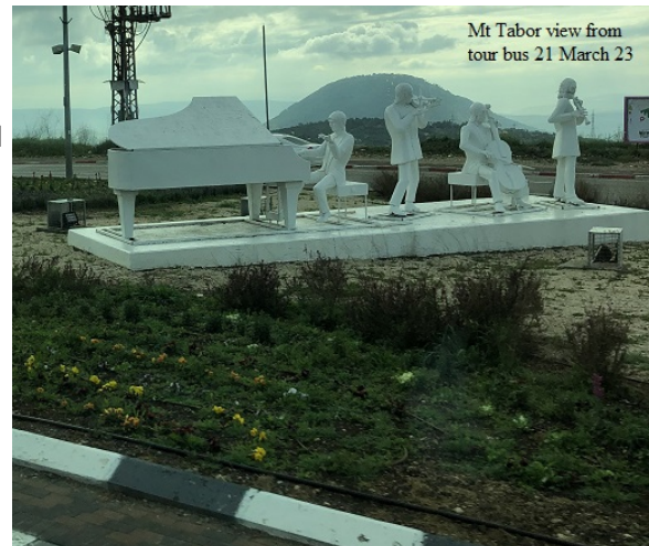
Mt Tabor view from tour bus 21 March 23

5. Next stop Beit Shean. Site of the hanging of King Saul's body on the city wall. Also the largest Archaeological dig in Israel. This is also the large Roman city of the Decapolis. 1Samuel 31:8-13.